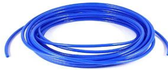
Fig. Pneumatic pipes

Pneumatic Pipes: These are hollow polyurethane pipes which are used to transport air from one component to other.